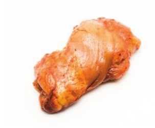
Marinated chicken steak