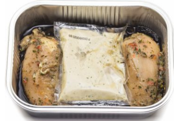
Chicken breast pieces in mushroom sauce