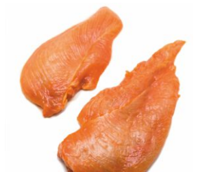
Marinated chicken schnitzel