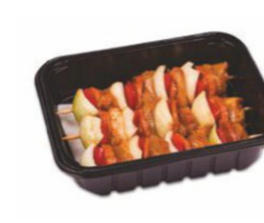
Chicken skewers with chorizo & pepper