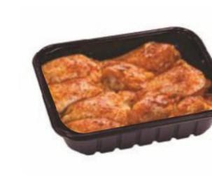
Marinated chicken 2-joint wings (mid+tip)