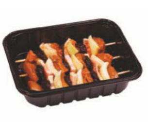
Chicken skewers with plum & bacon