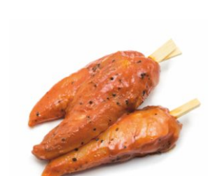
Inner fillet peri peri