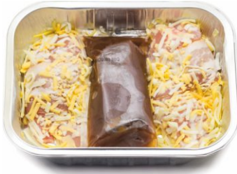
Hunters chicken breasts